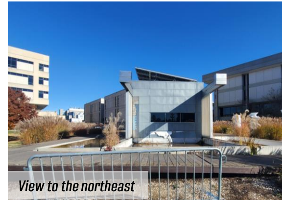
View to the northeast