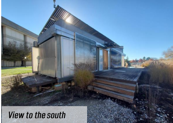
View to the south